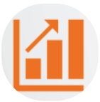
Increased System Efficiency