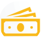
Lower Operational Costs