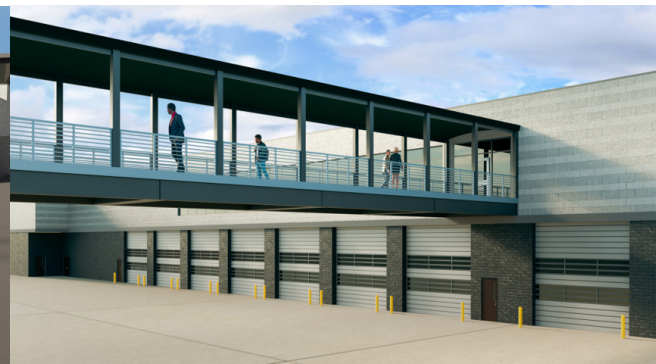
Rendering of Maintenance Building