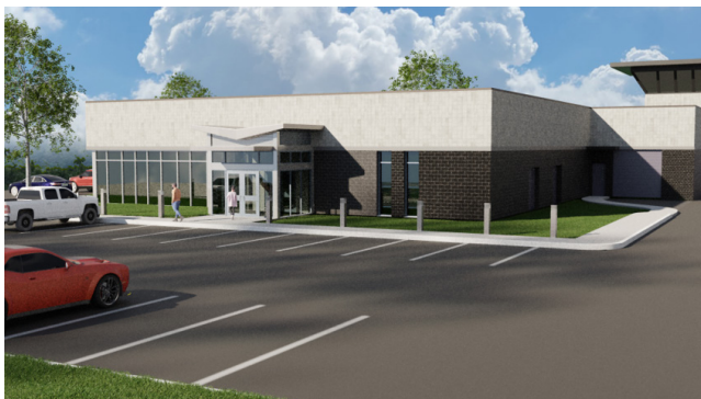
Rendering of Police Precinct